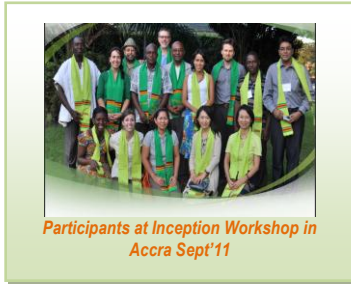
Participants at Inception Workshop in Accra Sept'11

The UNDP-supported project, “Community Development and Knowledge Management for the Satoyama Initiative” (COMDEKS), financed by the Japan Biodiversity Fund, was launched at a global inception workshop held in Accra, Ghana on 24-26 September 2011. The workshop brought together representatives of SGP Country Programmes from eight of the first eleven COMDEKS countries.