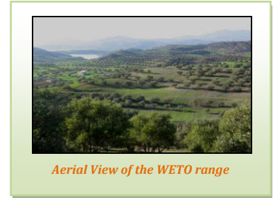
Aerial View of the WETO range